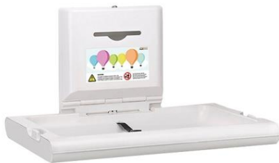
CP0016H Polypropylene White finish