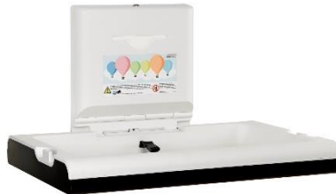
CP0016HCSB Polypropylene /Stainless steel Matte black finish