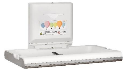
CP0016HCS Polypropylene /Stainless steel Satin finish